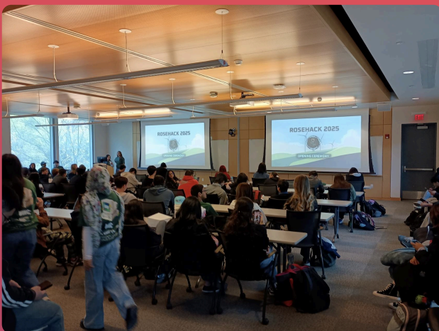
RoseHack 2025 Opening Ceremony

A hackathon is best described as an “invention marathon”. . Anyone who has an interest in technology attends a hackathon to learn, build & share their creations over the course of a weekend in a relaxed and welcoming atmosphere. Hackathons are an incredible way to bring your community together to learn new skills, build amazing projects, and share ideas!