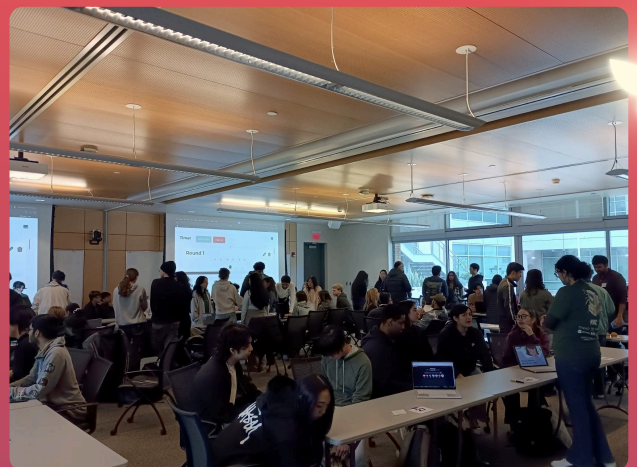
Our participants during the judging process!